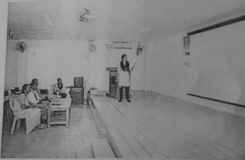
Participant actively present the paper - ISTE Student Chapter Coordinator & Jury observe the presentation